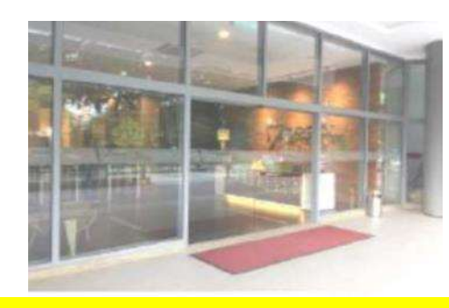
6. REGISTER AT LOBBY. WE ARE AT LEVEL 3 (UNIT 08)