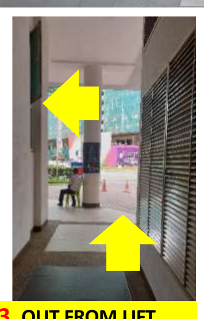
OUT FROM LIFT, TURN LEFT