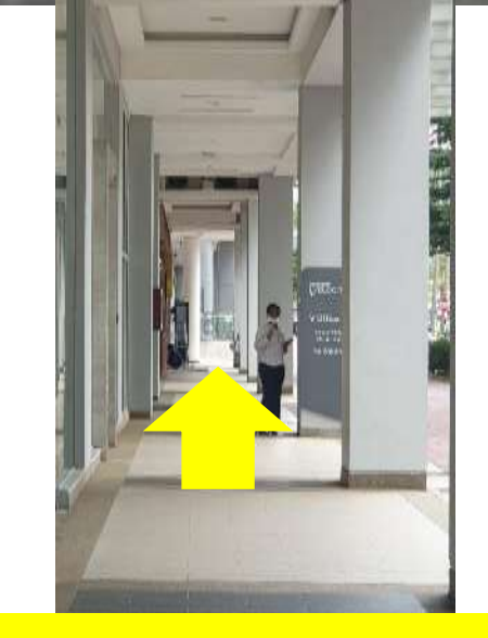
WALK TO DESIGNER OFFICE You will see an orange signboard Restoran SAN CAN BAN